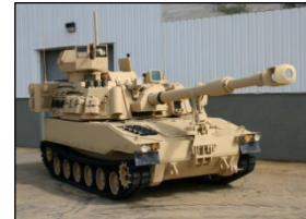
Paladin PIM $260M Modernizing Fire Support