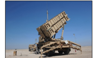
Patriot MSE $540M Missile Segment Enhancement