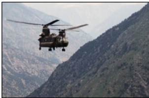
CH-47 Chinook $1,050M F Model upgrade & mods