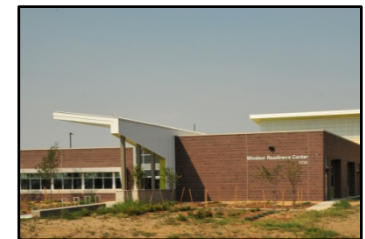
National Guard Readiness Center Windsor, CO

Supports Army priorities for developing the force of the future and the Army Facility Investment Strategy