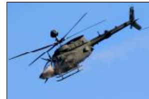
Kiowa Warrior $184M Mods