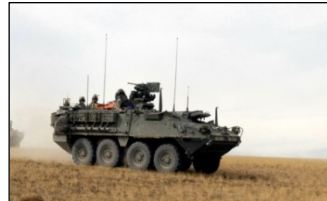
Stryker $395M Double V-Hulls & mods