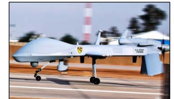
MQ-1 Gray Eagle UAV $518M Equip one (+) company