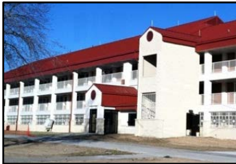
Barracks ♦ Fort Stewart, GA

Numbers may not add due to rounding * Hurricane Sandy Supplemental