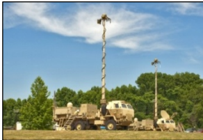
The Network $1,808M Connect the Force

The FY 2014 OCO Request will be submitted at a later date