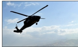
UH-60 Black Hawk $1,237M M Model upgrade & Mods